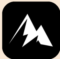
Devs Neve Labs | @NeveLabs

Has been in the Solana NFT space for more than 1 and half years and idealized the collection to be a distuption on Solana.